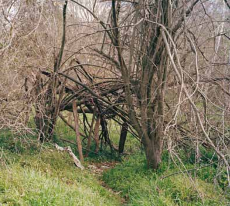
Image: Thomas Breakwell Squat #4 2010 from the series Squats inkjet print 50 x 60 cm. Winner 2011CCP Documentary Photography Award.