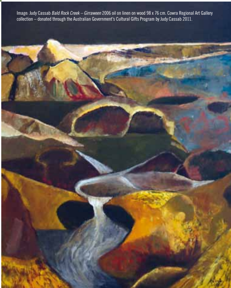
Image: Judy Cassab Bald Rock Creek - Girraween 2006 oil on linen on wood 98 x 76 cm. Cowra Regional Art Gallery collection - donated through the Australian Government's Cultural Gifts Program by Judy Cassab 2011.

Olive Cotton: Photographs is an exhibition of Olive Cotton photographs from the Cowra Regional Art Gallery Collection and works on loan from the Josef Lebovic Gallery, Sydney. The exhibition includes significant photographs that highlight Olive