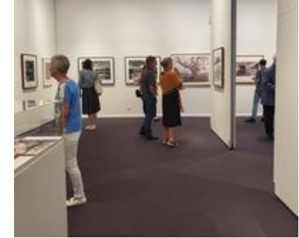
Above Visitors viewing the prints on display at the exhibition opening