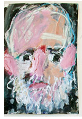
Image: Craig Waddell, 35 Days with You (detail), 2020, ink, watercolour, pastel and gouache on paper, 220 x 220cm, image courtesy and o the artist.

The exhibition showcases the finalists' artworks across a broad range of media that acknowledges the foundational principals of drawing, while also encouraging challenging and expansive approaches to drawing. Toured by the National Art School, Sydney