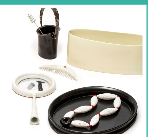
Image: Esme's dressing table (group of multiple pieces). 2017 (detail)

Numerous national and international exhibitions, awards and publications celebrate the fine porcelain work of Prue Venables. Included in many public and private collections worldwide, these pots explore complex and unusual approaches to working with porcelain, challenge the significance of daily objects and highlight the richness that they bring to our lives. Forms are deceptively simple, stand quietly, with light dancing on the sprung tension of their rims, their softly melting forms inviting touch. A Touring exhibition by the Australian Design Centre.