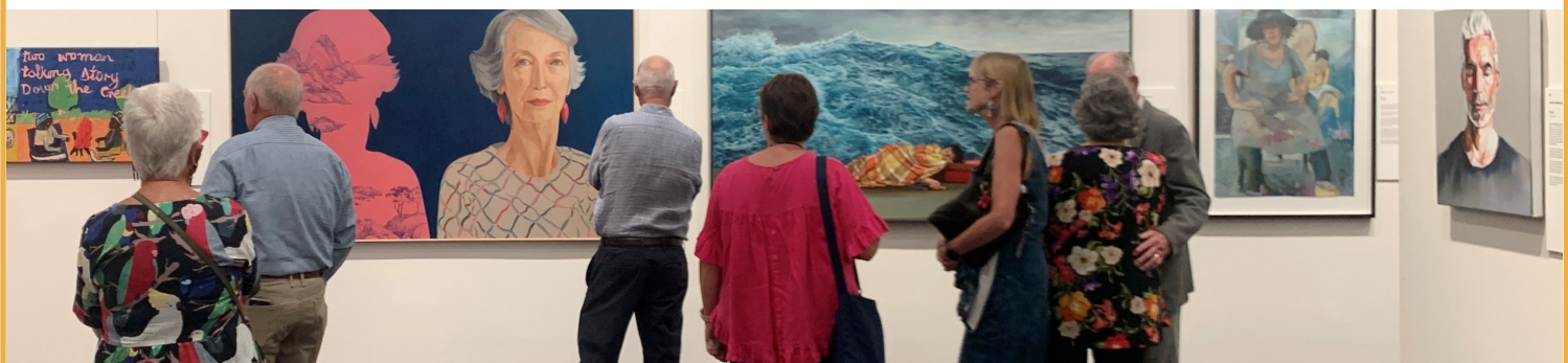
Image: visitors at the Archibald Prize 2021 touring exhibition

To become a Friend of the Gallery, to renew your membership or to update your details please contact the Gallery on (02) 63402190.