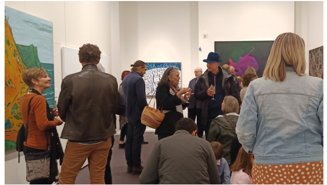
Image : Visitors at the opening of the Calleen Art Award 2022