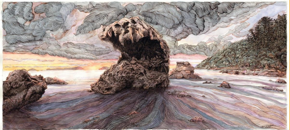
Giant rock cape hills borrough, pen ink watercolour 93.5x123cm