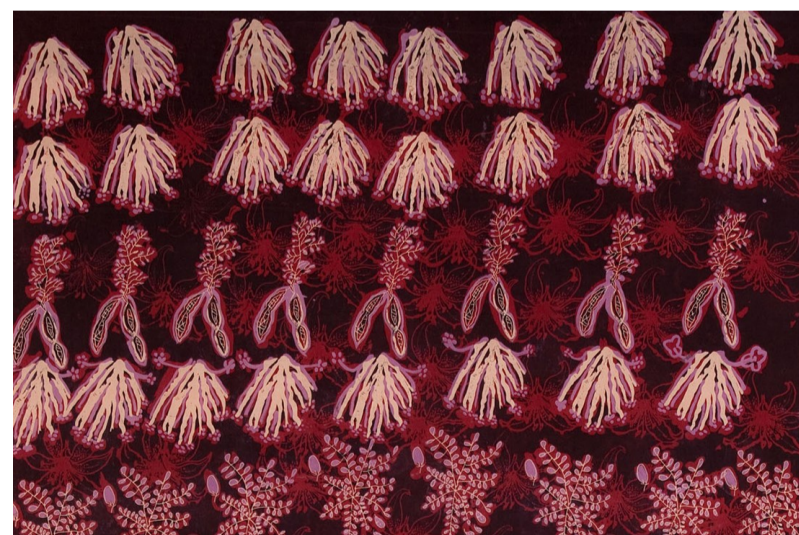
Image: Utopia Batik Collective, Sample Piece (collective testing of tjap technique), 1995, batik, azoic dyes, silk satin, 235 x 115 cm. The Utopia Collection™ Bequest

77 Darling Street, Cowra NSW 2794 ADMISSION FREE