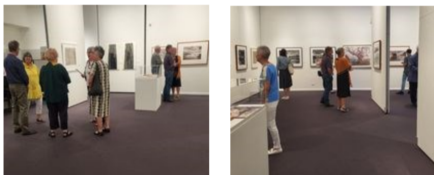
Above Visitors viewing the prints on display at the exhibition opening