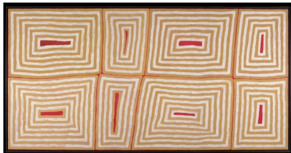
Image: Ronnie Tjampitjinpa, Untitled painting of concentric rectangles (detail) 1996, paint on canvas, 1260 x 2460cm.

The exhibition was presented as part of a cultural exchange program by the National Museum of Australia with the National Art Museum of China (NAMOC), Beijing in 2021. The Red Heart tour is supported by the National Collecting Institutions Touring and Outreach Program (NCITO).