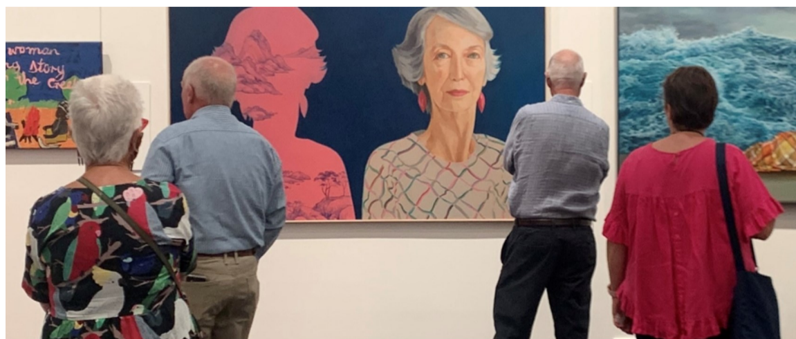
Image: visitors at the Archibald Prize 2021 touring exhibition

To become a Friend of the Gallery, to renew your membership or to update your details, please contact the Gallery on (02) 63402190.