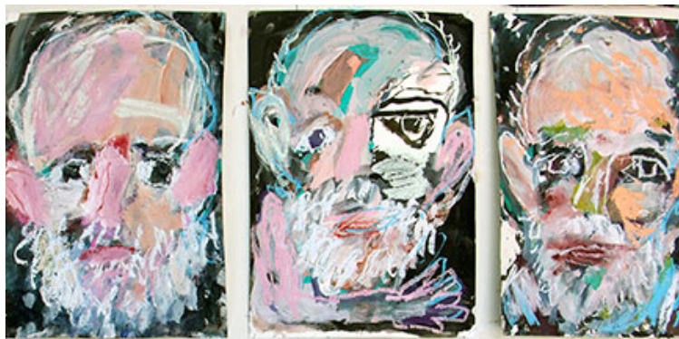
Image: Craig Waddell, 35 Days with You (detail), 2020, ink, watercolour, pastel and gouache on paper, 220 x 220cm, image courtesy and © the artist.

The exhibition showcases the finalists' artworks across a broad range of media that acknowledges the foundational principals of drawing, while also encouraging challenging and expansive approaches to drawing. Toured by the National Art School, Sydney