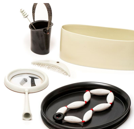
Image: Esme's dressing table (group of multiple pieces). 2017 (detail)

Numerous national and international exhibitions, awards and publications celebrate the fine porcelain work of Prue Venables. Included in many public and private collections worldwide, these pots explore complex and unusual approaches to working with porcelain, challenge the significance of daily objects and highlight the richness that they bring to our lives. Forms are deceptively simple, stand quietly, with light dancing on the sprung tension of their rims, their softly melting forms inviting touch. A Touring exhibition by the Australian Design Centre.