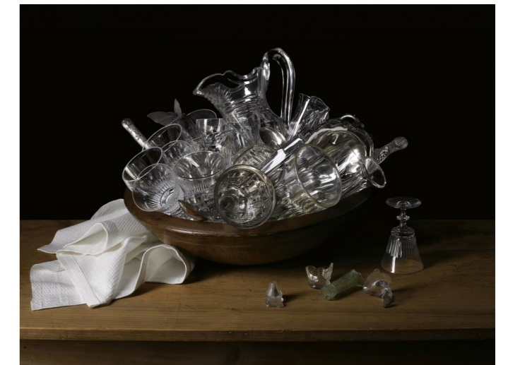
Image: Robyn Stacey Miss Eliza Wentworth's glassware 2008 from the series The great and the good chromogenic print 120.0 x 160.2 cm. Monash Gallery of Art, City of Monash Collection acquired with the funds raised by Friends of MGA Inc 2009. Courtesy of the artist, Darren Knight Gallery (Sydney) and Jan Manton Gallery (Brisbane)