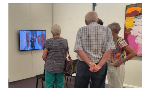
Pictured above are members of Cowra U3A group at the Gallery and left visitors during the opening of the exhibition.