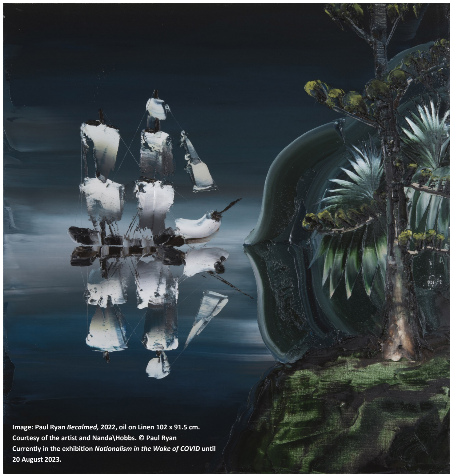
Image: Paul Ryan Becalmed , 2022, oil on Linen 102 x 91.5 cm. Courtesy of the artist and Nanda\Hobbs. © Paul Ryan Currently in the exhibition Nationalism in the Wake of COVID until 20 August 2023.