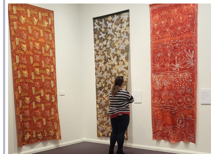
Pictured above is a Gallery visitor admiring the Batik textiles on display during the opening of the exhibition

The Utopia Batik collection is an archive of assembled pieces by some of Australia's most prominent aboriginal women artists of the Eastern Anmatyerre and Alyawarre people, centred at the remote community of Utopia, 270 kms north east of Alice Springs.