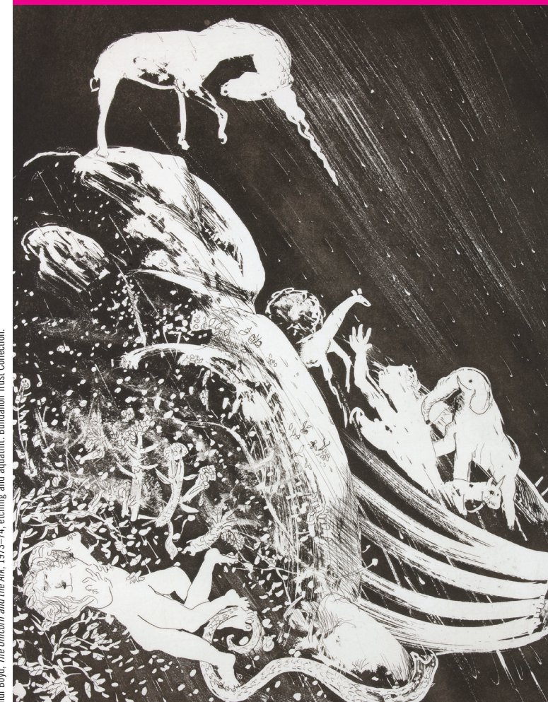
Front cover image: Arthur Boyd, The Unicorn and the Ark , 1973–74, etching and aquatint. Bundanon Trust Collection.