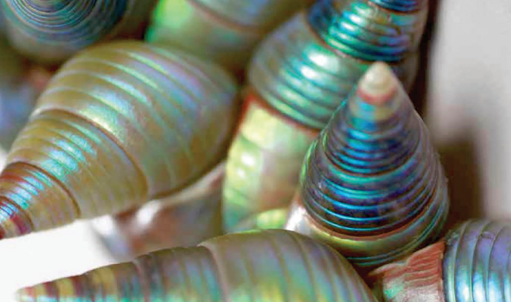
Above: Lola Greeno, teunne (king maireener shell crown) (detail) 2013, king maireener shells, cotton thread, diameter 250mm.

COMING UP 12 December 2015 to 7 February 2016